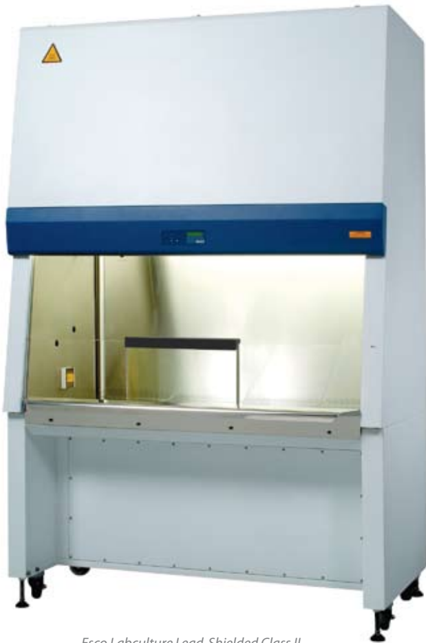
Esco Labculture Lead-Shielded Class II with the standard horizontal sliding lead glass

The Esco Labculture® Lead-Shielded Class II biosafety cabinet is designed for radiopharmaceutical industry usage and protects the operator during work involving radioisotopes.